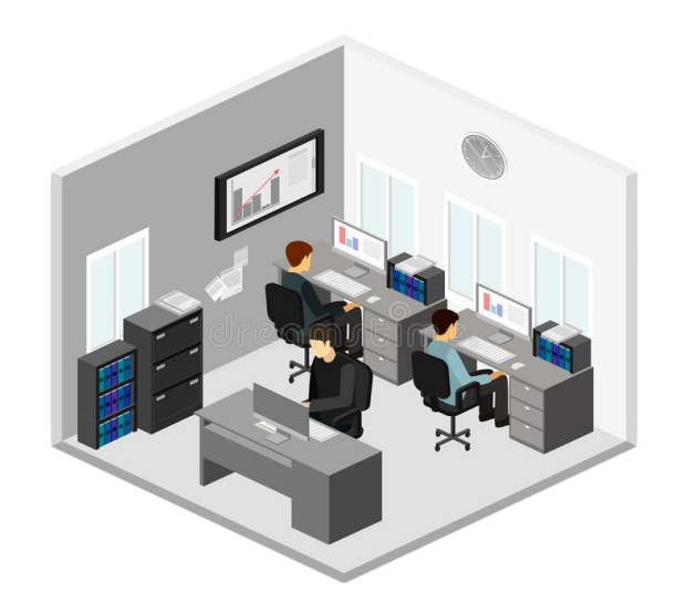
Real Estate Valuation